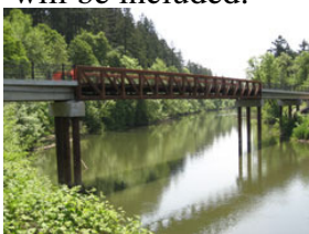
Photo: Ki-a-Kuts Bridge where the Ice Age Tonquin and Fanno Creek trails meet at the Tualatin River.

Nyberg Rivers will be one "stop" on the proposed Tualatin Ice Discovery Trail looping through the city. Anchor points will be the mastodon dig site near Fred Meyer and Tualatin Heritage Center. Existing resources such as Ki a Kuts Pedestrian Bridge, Lake at the Commons, Library mastodon skeleton will be included.