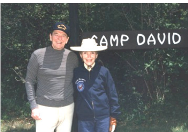
Photo: President Reagan and First Lady Nancy Reagan enjoy some R & R at Camp David.